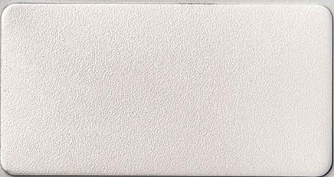
936 TR Mid Crème