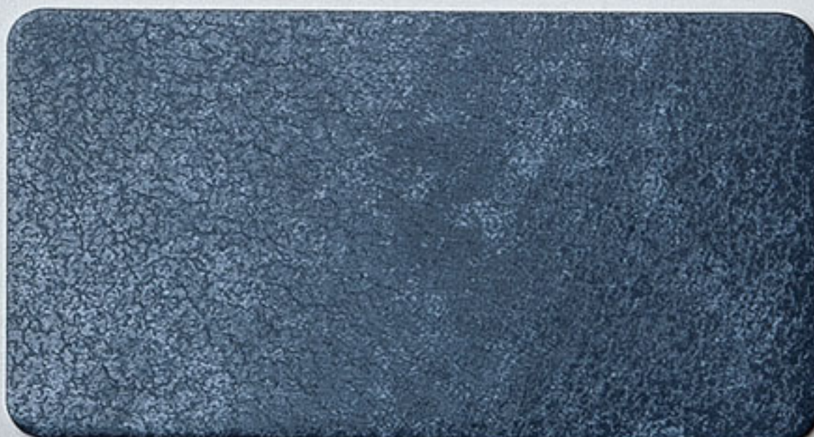
924 TX Velvet Grey