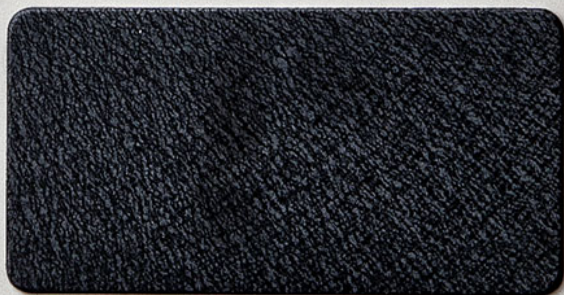
818 Ceramic Orbit Black