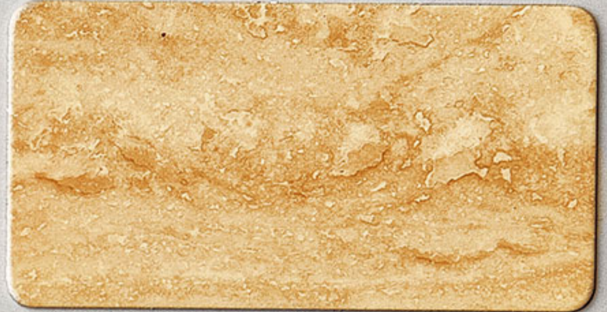
963 Jerusalem Stone