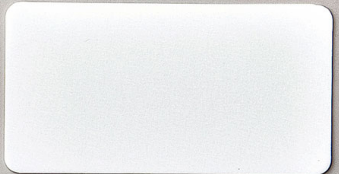
817 TX SJ 9016