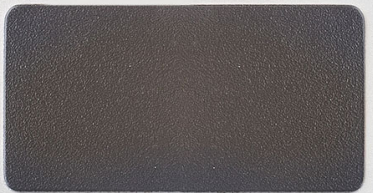
940 TR Griggio