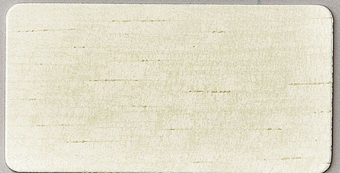
815 Basalt Crème