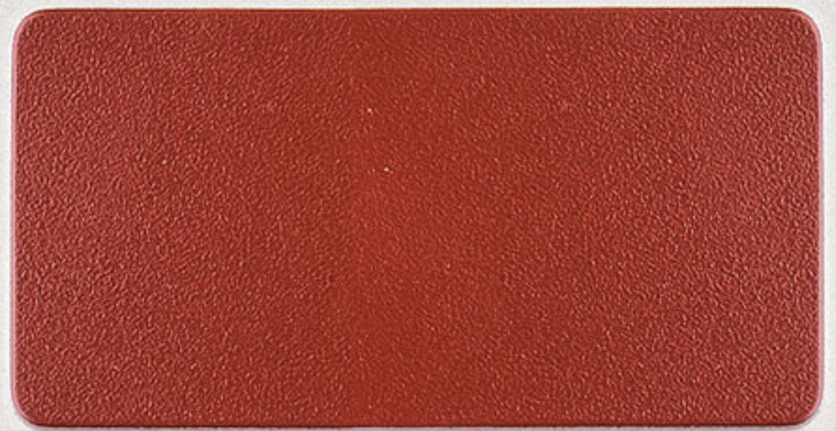
932 TR Siena Rosso