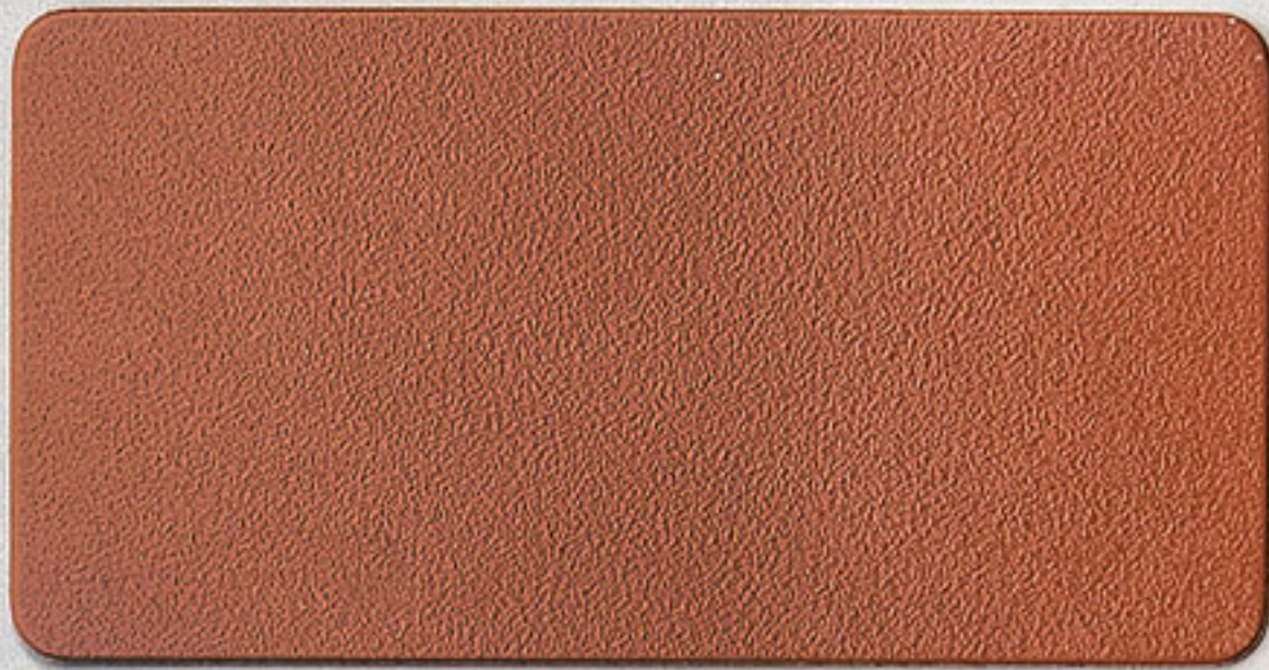
942 TR Tile