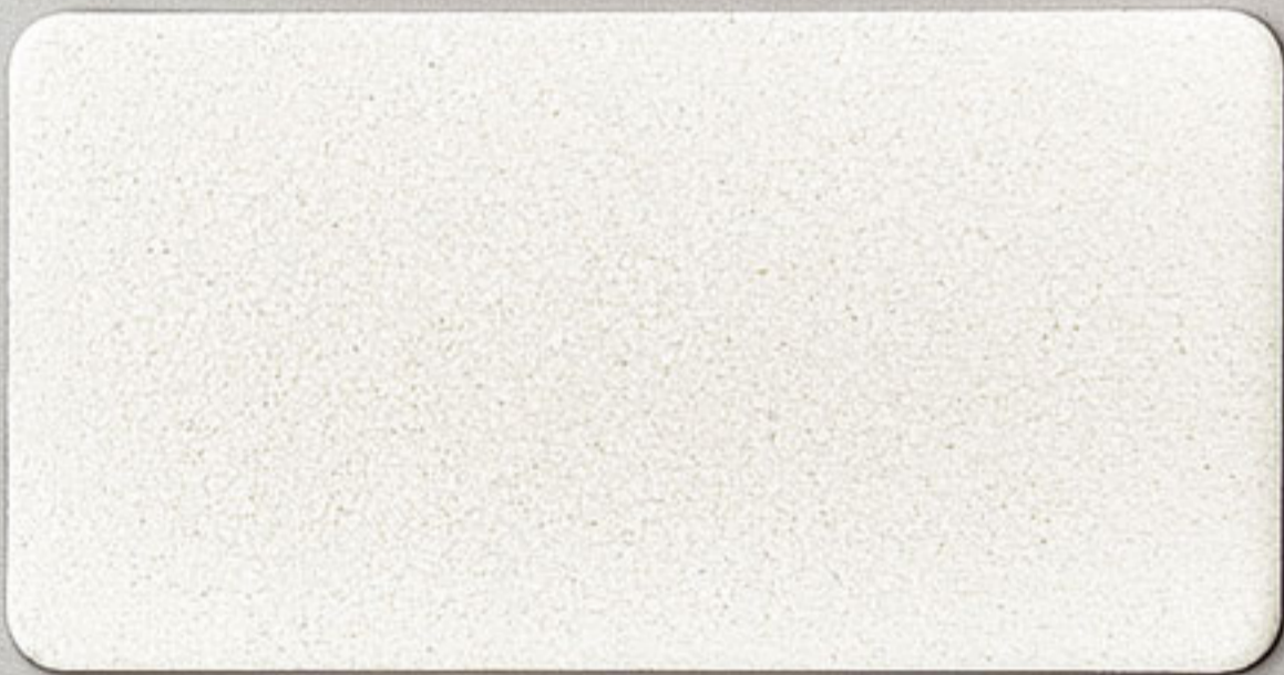
965 GFRC Sahara Crème