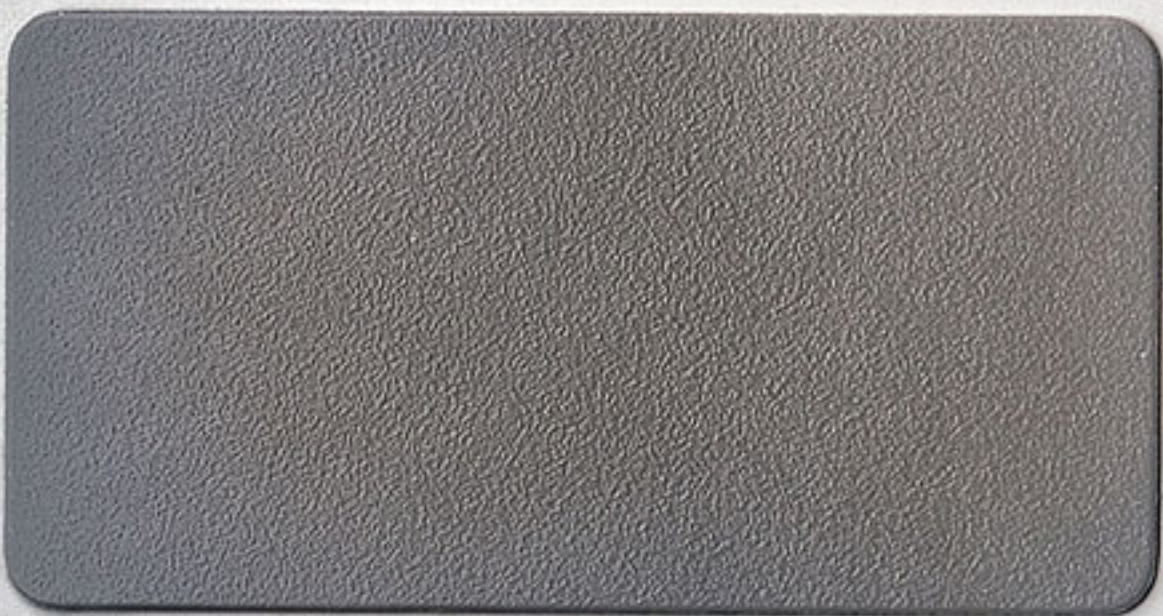
931 TR Brown Grey