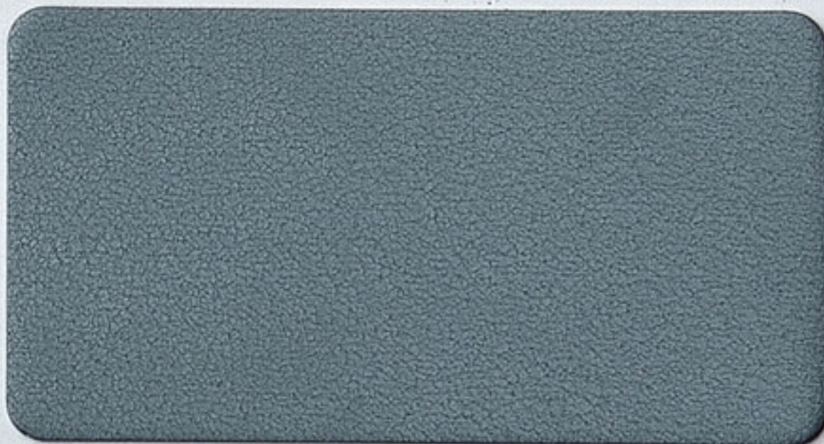
923 TX Alpine Grey