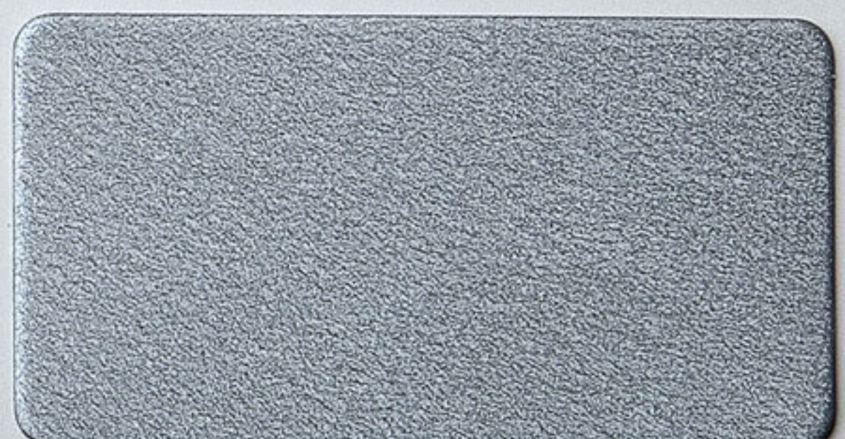
922 TX Metallic Grau