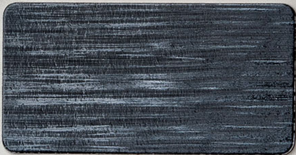
816 Basalt Black