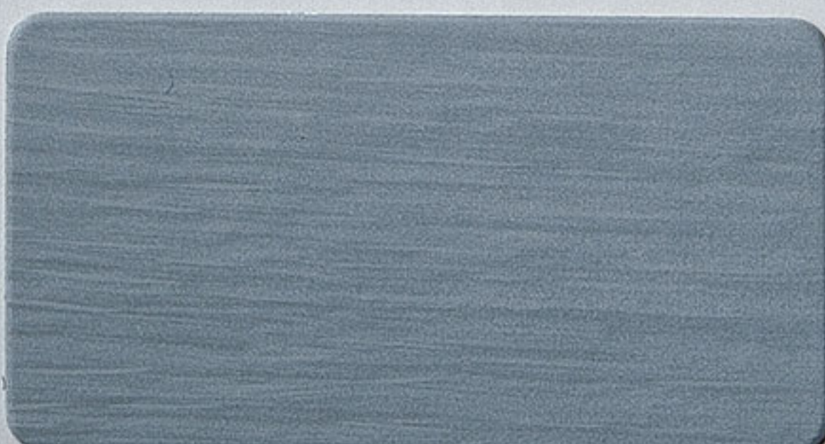
925 TX Velvet Zinc