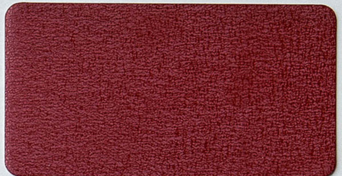
921 TX Ceramic Red