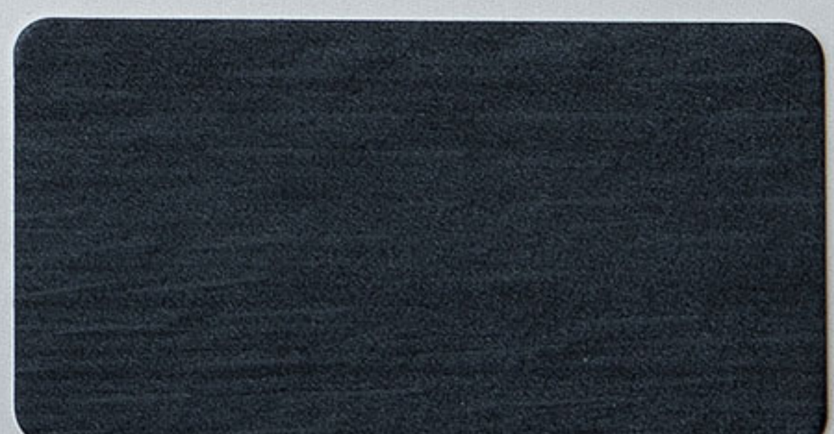
926 TX Velvet Basalt