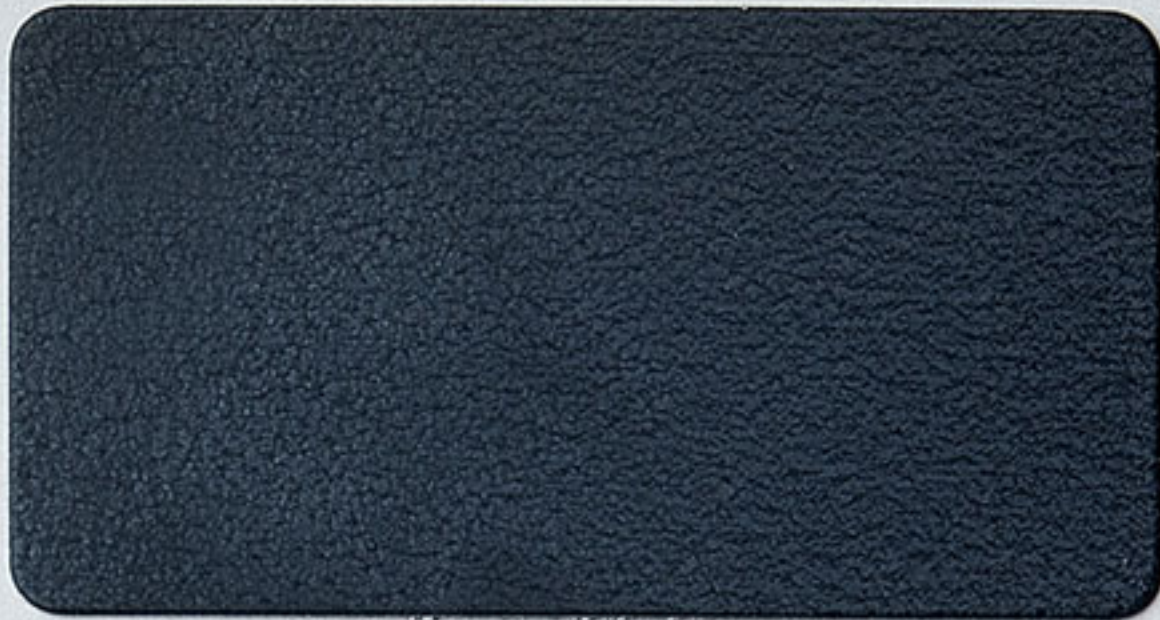
920 TX Anthracite