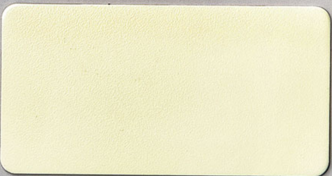
934 TR Marilion