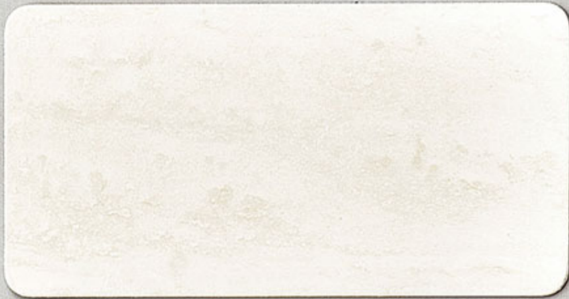
964 Travertine Favale