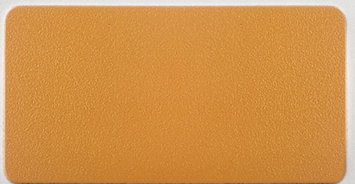
939 TR Brazil