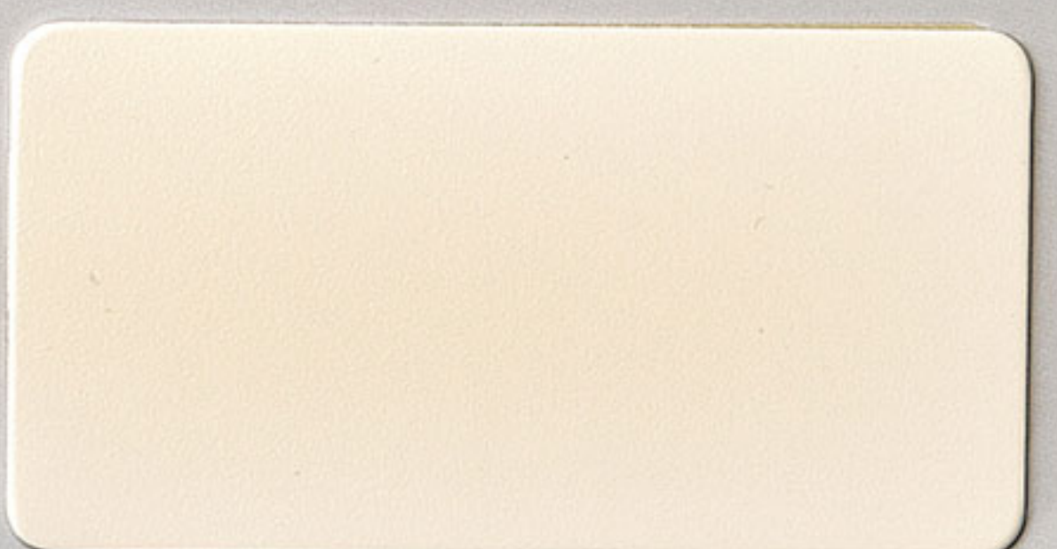
935 TR Marilion Crème